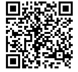
Curry County 4-H Youth Leadership Survey

https://acesnmsu.az1.qualtrics.com/jfe/form/SV8iAQGLEqdVQrtSC